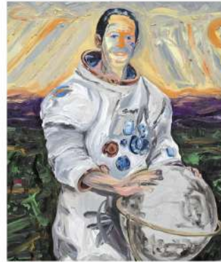
Il Piano del Cavaliere

The estate spans 32 hectares, with 28 hectares planted to vines. Nestled in the scenic Colline Teatine, I Fauri boasts 14 unique vineyard plots spread across six municipalities: Chieti, Francavilla al Mare, Miglianico, Ari, Bucchianico, and Villamagna. A mosaic of diversity and flavor, each year, they craft a selection of seven still wines, from the robust Baldovino Montepulciano to the crisp Pecorino grapes, as well as three sparkling wines. Every bottle tells a story of passion, heritage, and the vibrant spirit of Abruzzo.